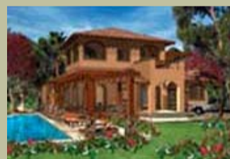
Typical Construction Rendition