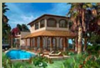
Typical Construction Rendition