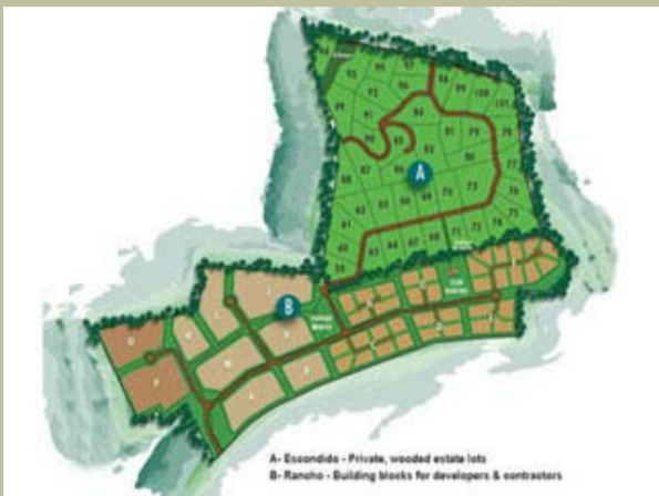
Rancho Villa Real Plat

El Rancho offers a combination of 1/2 acres lots and a townhome section, while Escondido has 42 exclusive lots. All this is combined with Club Rancho, the homeowner's private club and center.